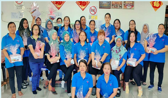
Celebration of Women's Day, Sport activity, Karaoke Competition etc.