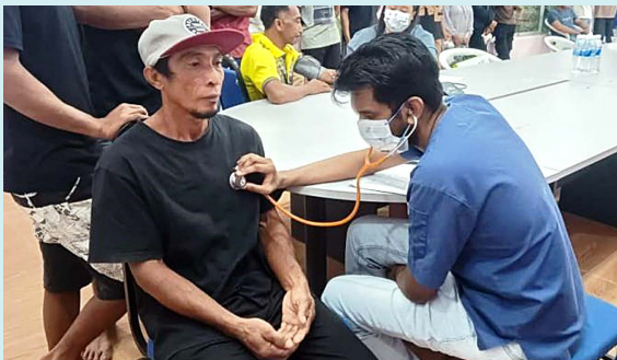
Annual workers medical check-up at plantation.