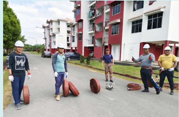
Latihan dan Pertandingan Organisasi Keselamatan Kebakaran Peringkat Zon Miri.