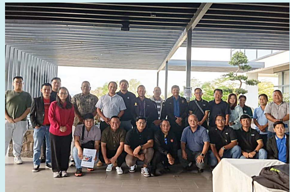
Chemical Safe Handling & Storage training.