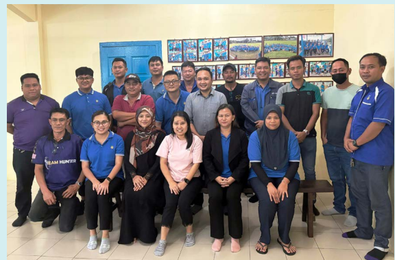
Ergonomics and Manual Handling in the Workplace.