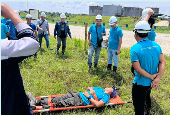
On-Site Fire Drill Training.