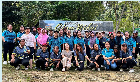
Organised gotong-royong activity at recreational area.