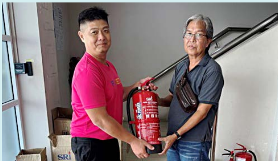
Donation of fire extinguishers to nearby communities.