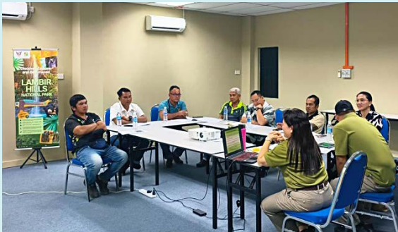
Attended Park Committee Meeting at Taman Negara Bukit Lambir.