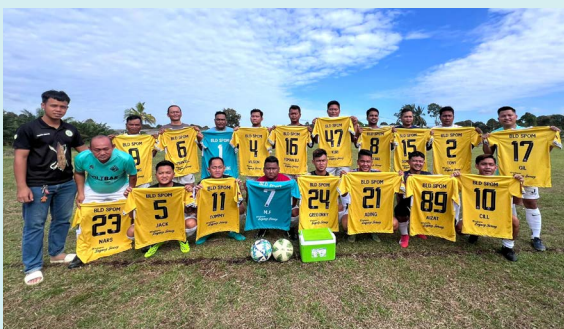
Sponsorship for employees such as football jerseys and distribution of essential goods during festivals.