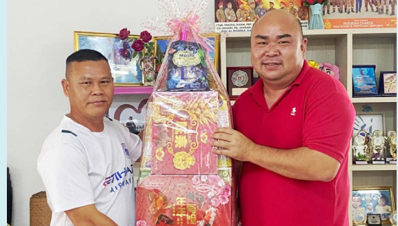
Hamper sponsorship to Jabatan BOMBA dan Penyelamat Miri during Gawai.