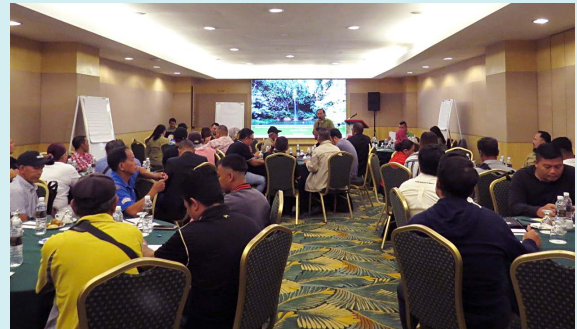
Attended "Bengkel Pengenalan Asean Heritage Park" at Taman Negara Bukit Lambir.