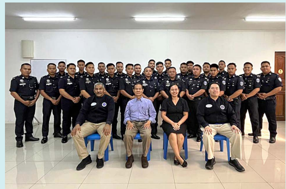
Kursus Pemantapan Penugasan Polis Bantuan.