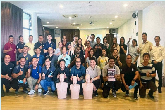
In house training of Basic Occupational First Aid, CPR AED for Sibul, Miri and Bintulu region.