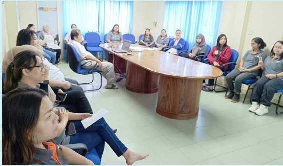
Establishment of Women Welfare Committee in refinery.