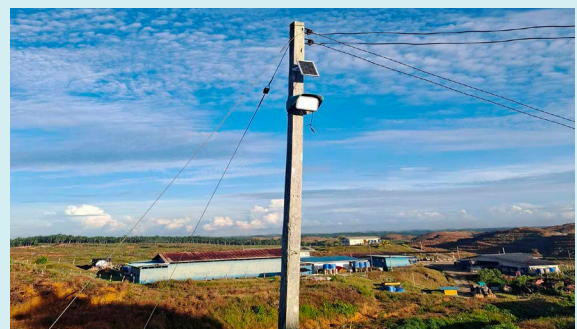
Installation of solar light at plantation housing area.