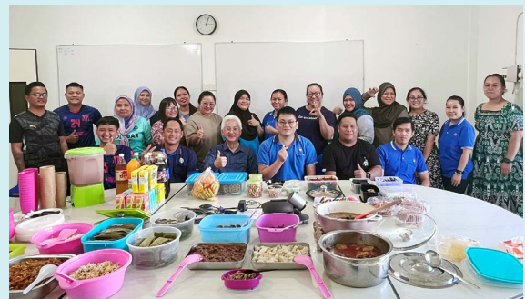
Organised gathering with employees for Gawai, Hari Raya and Labour Day.