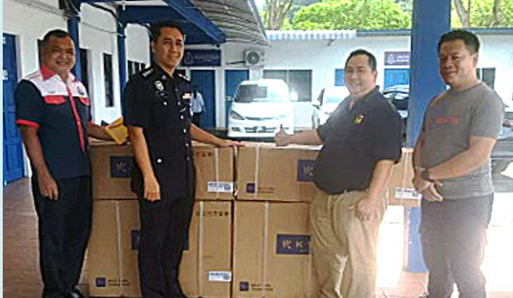
Donation of air-conditioning units and boltless rack to Pejabat Polis Daerah Miri.