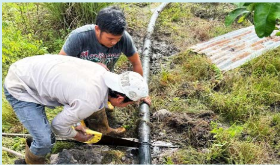
Provide assistance to local communities.