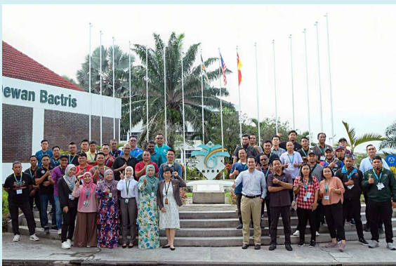
Kursus Pengendalian Makmal Kilang Kelapa Sawit at MPOB.