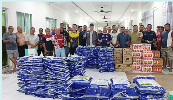
Donation of food supplies to nearby longhouses affected by flood.