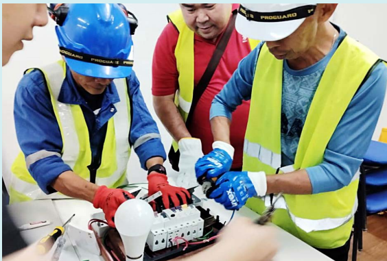
Electrical Safety at Workplace training.